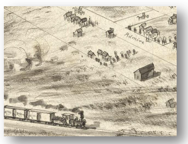
El Reno, Oklahoma Territory 1891.

Click the link above and choose the link for "Geographic Location", and then click "Oklahoma."