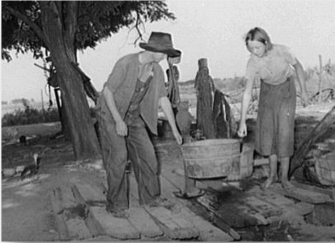
Children of a tenant farmer, Muskogee, OK, 1939.

The Great Depression brought many economic problems to Oklahoma in the 1930s. Farm prices were low and many factories, banks, and businesses closed.