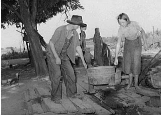
Children of a tenant farmer, Muskogee, OK, 1939.

The Great Depression brought many economic problems to Oklahoma in the 1930s. Farm prices were low, and many factories, banks, and businesses closed.