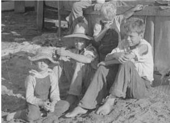
Children of a sharecropper, Manning, SC, 1939.

The Great Depression brought many economic problems to South Carolina in the 1930s. Farm prices were low and many factories, banks, and businesses closed.