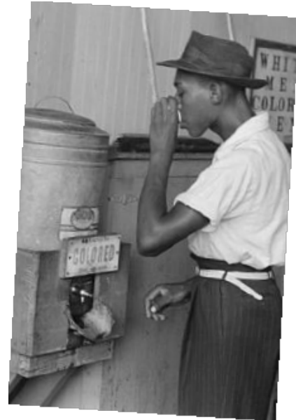
This photo was taken in Oklahoma City in 1939. It shows a young African American drinking from a water cooler marked “Colored.”

3. Click on Events . Click on Plessy v. Ferguson (1896) . Read about the decision and watch the video. Write one sentence explaining the significance of this decision.